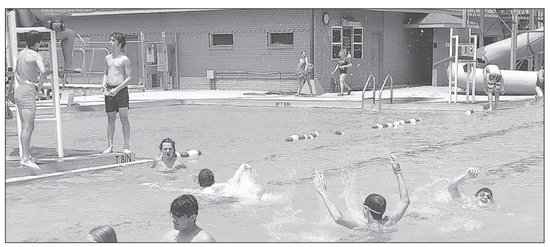
CHILDREN SPLASH and play in the Tuscola pool at the long-awaited pool opening on June 21.