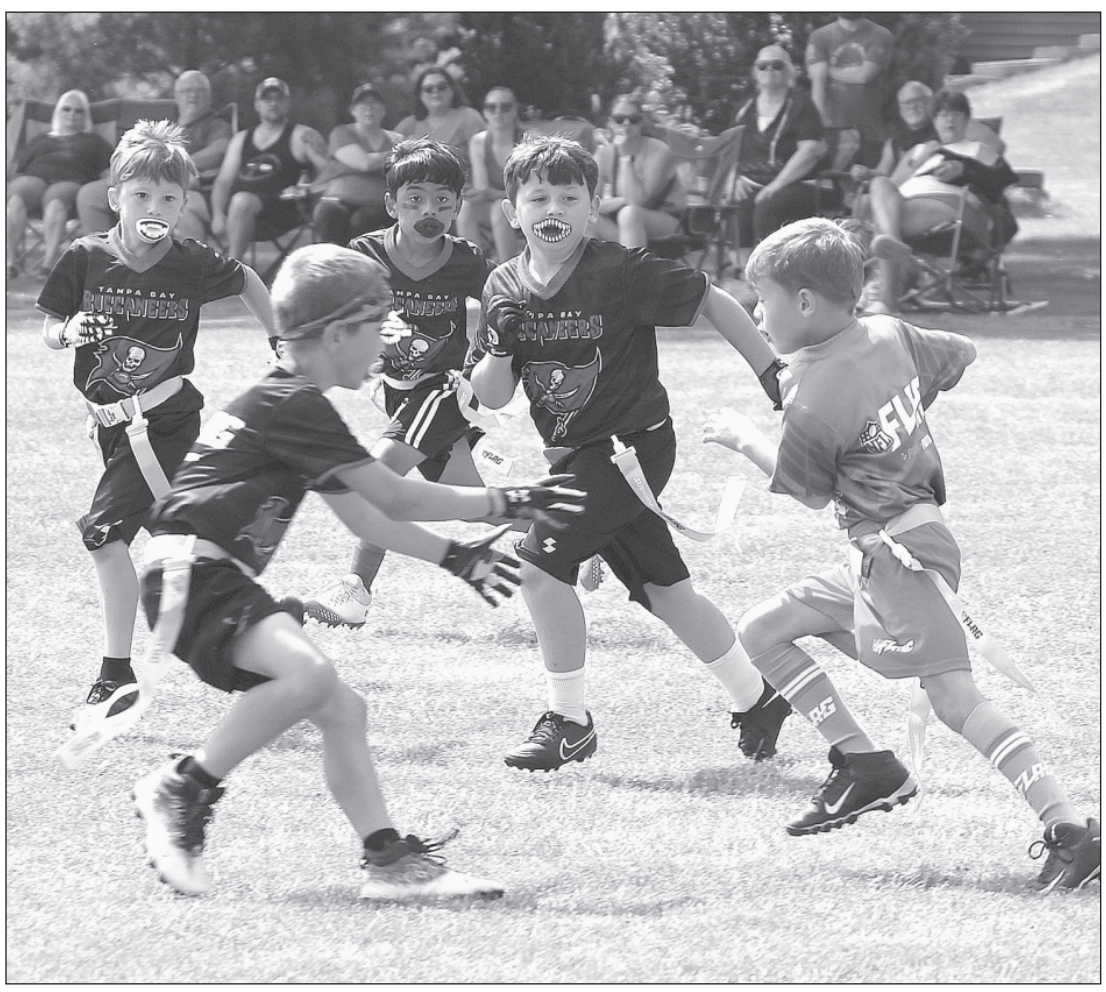
TUSCOLA FLAG FOOTBALL hosted a game between the rookie "Buccanneers" and "Dolphins" The Buccanneers won the game on June 23.