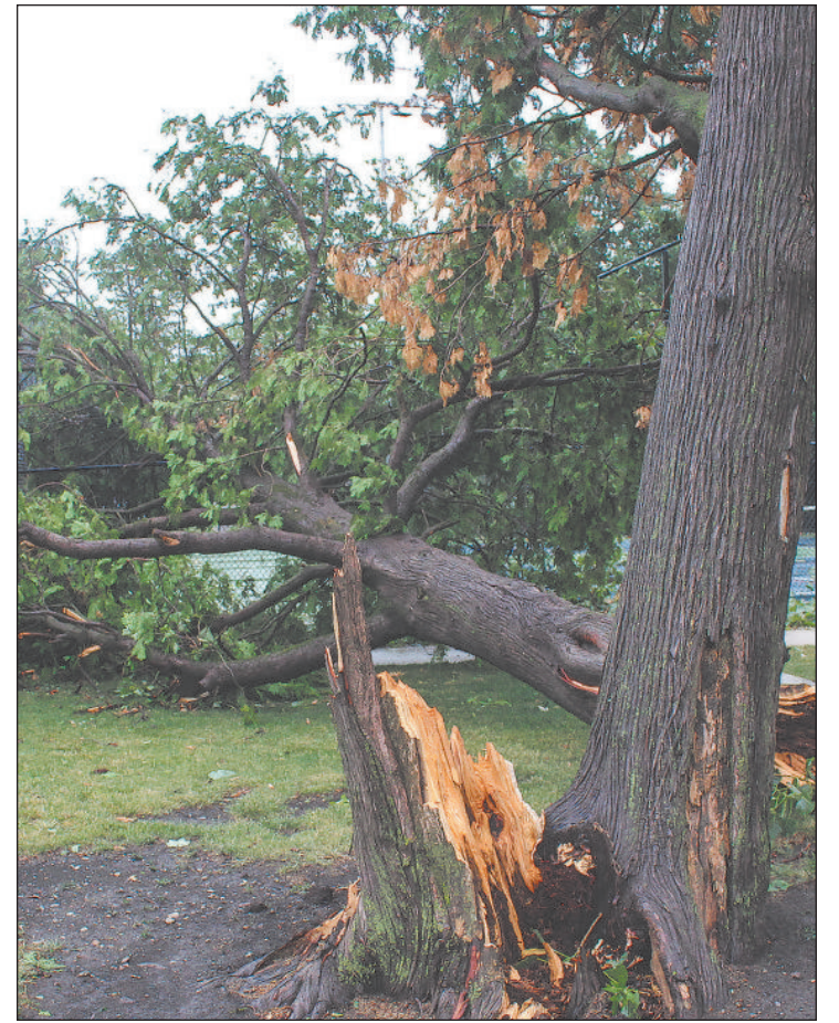
ERVIN PARK in Tuscola suffered heavy damage to trees and facilities.