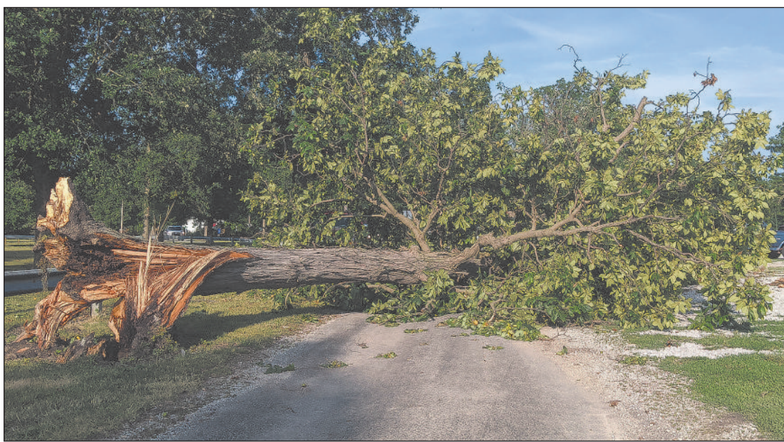
SEVERAL TREES IN VILLA GROVE were uprooted or broken off at ground level.