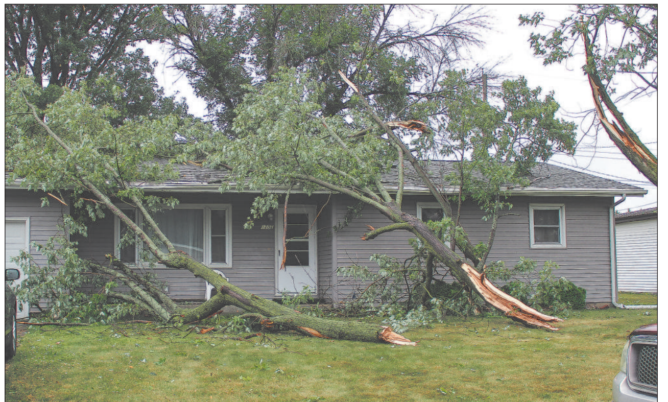
THIS HOUSE IN PARKVIEW in Tuscola suffered a double whammy with tree branches.

Canadian wildfire smoke, fist-sized hail and hurricane-force winds converged on Douglas County last week bringing with it irritation, astonishment and severe