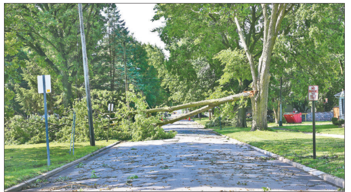
FRIDAY MORNING, June 30, North Sheldon Street, between East Jefferson and East Main streets, Arcola.