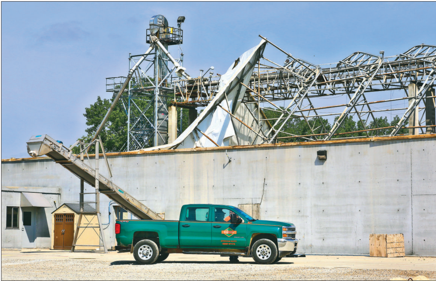
THE STORM RIPPED the roof off a building at The Equity in Galton.