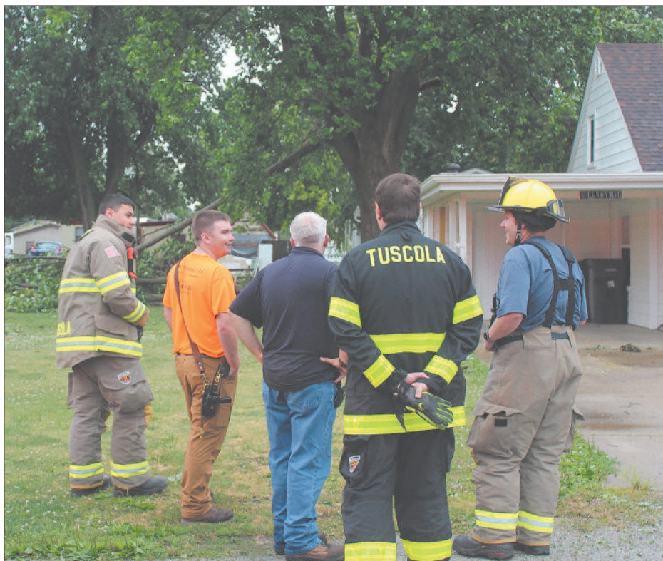
FIREFIGHTERS IN TUSCOLA assess tree damage.