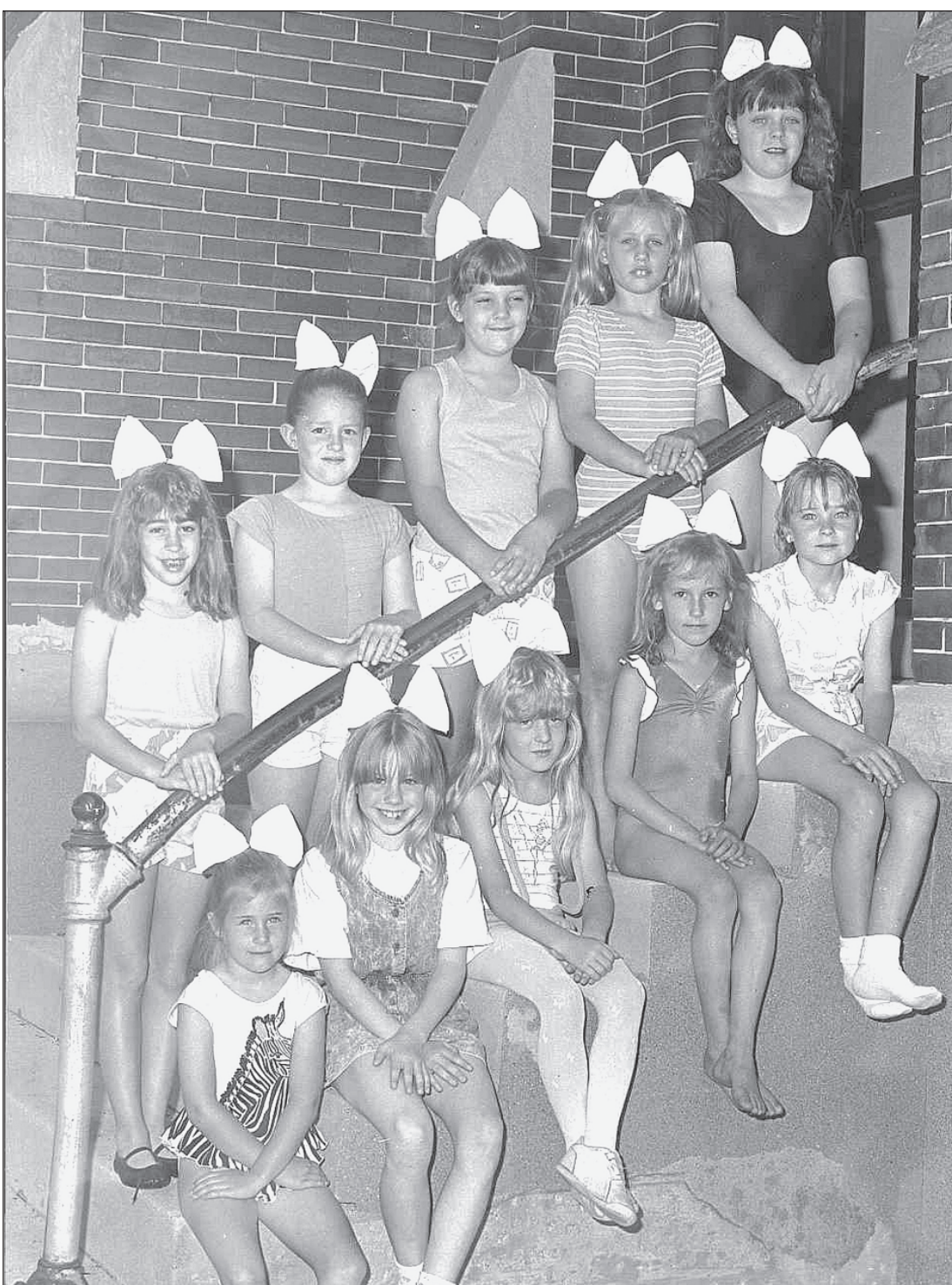
DO YOU RECOGNIZE this week's Back in the Day photo? If so, drop us a note at The Journal. Your efforts will be rewarded.