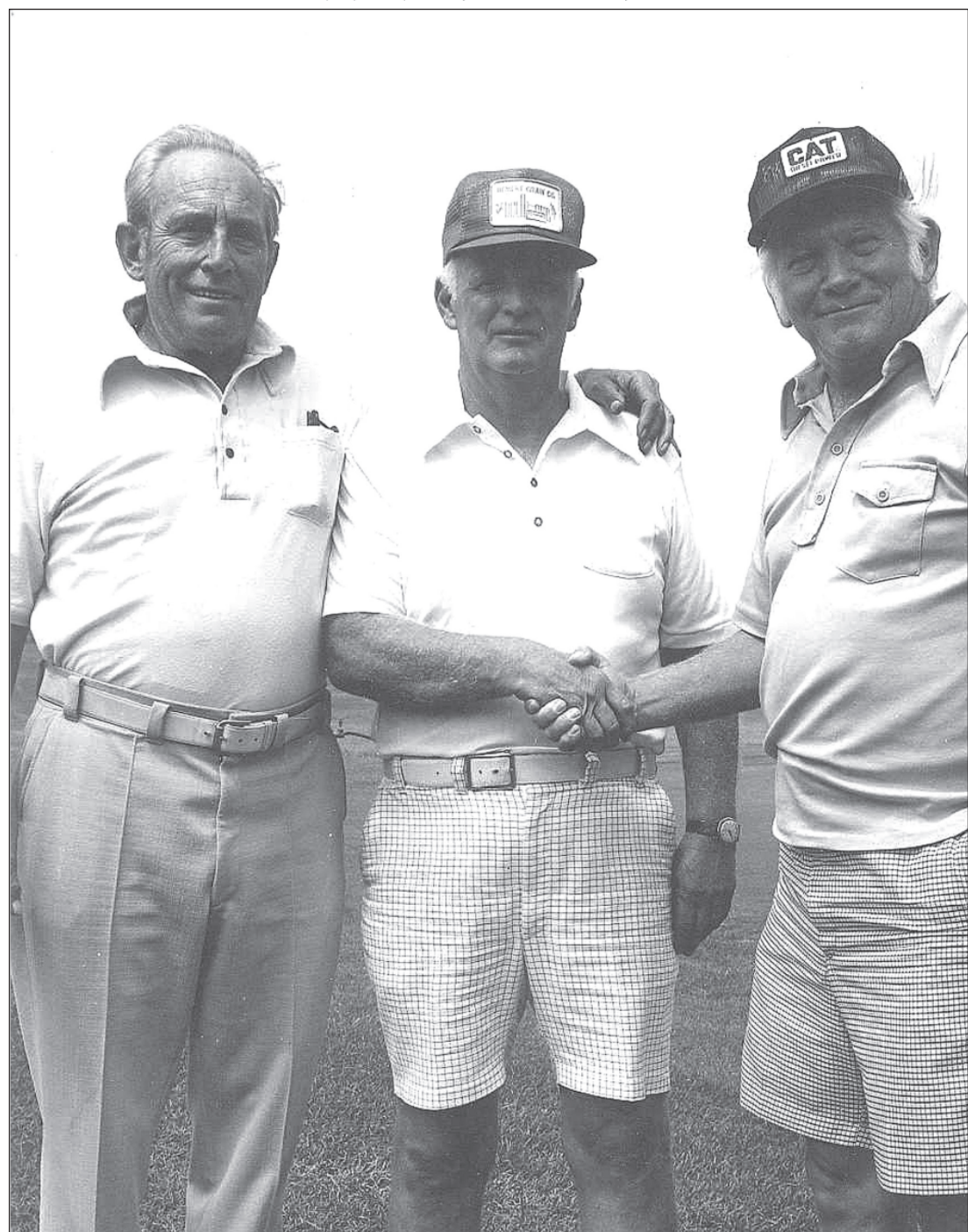
DO YOU RECOGNIZE this week's Back in the Day photo? If so, drop us a note at The Journal. Your efforts will be rewarded.

State legislators recently passed a $135 million in-