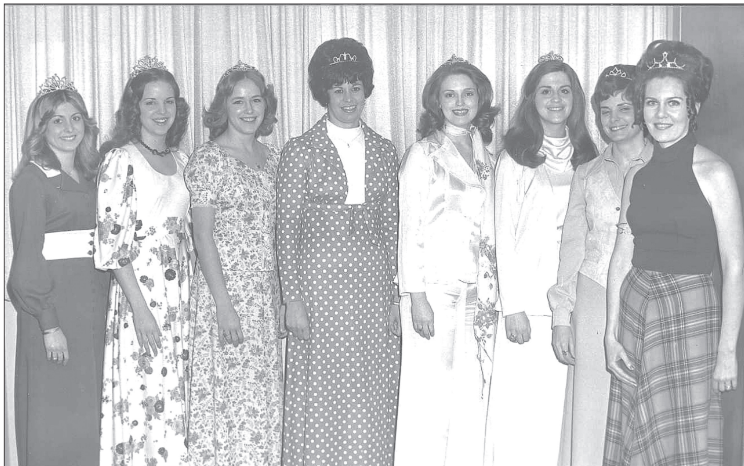
DO YOU RECOGNIZE this week's Back in the Day photo? If so, drop us a note at The Journal. Your efforts will be rewarded.