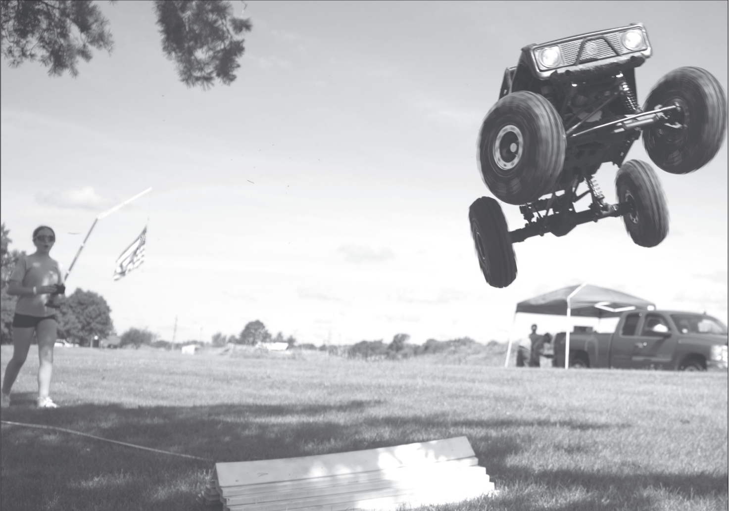
EMILY VANCE-BLAIS launches her remote controlled truck off a small ramp in the dakar rally race during RC Fest in Wimple Park. The mile-long track went through the hill as well as the wooded portions of Wimple Park.