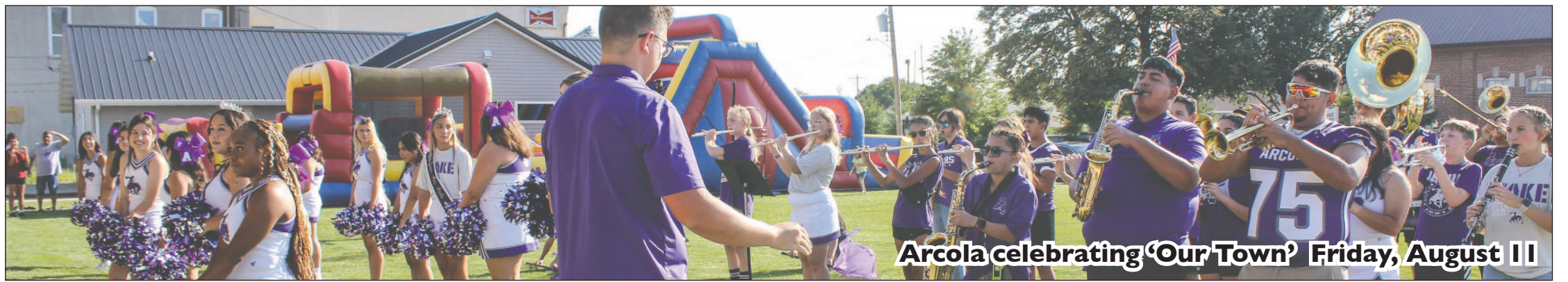
Arcola celebrating 'Our Town' Friday, August 11