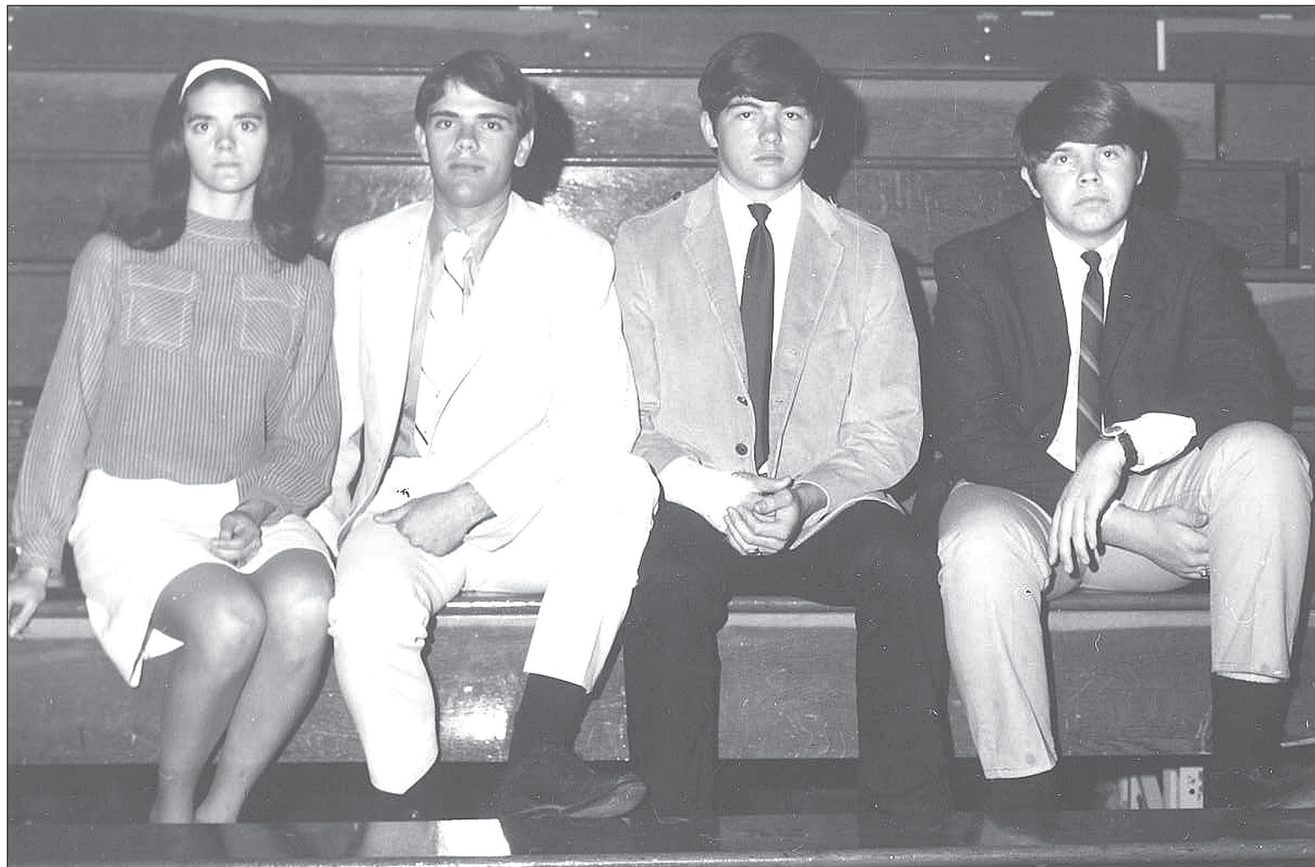
DO YOU RECOGNIZE this week’s Back in the Day photo? If so, drop us a note at The Journal. Your efforts will be rewarded.