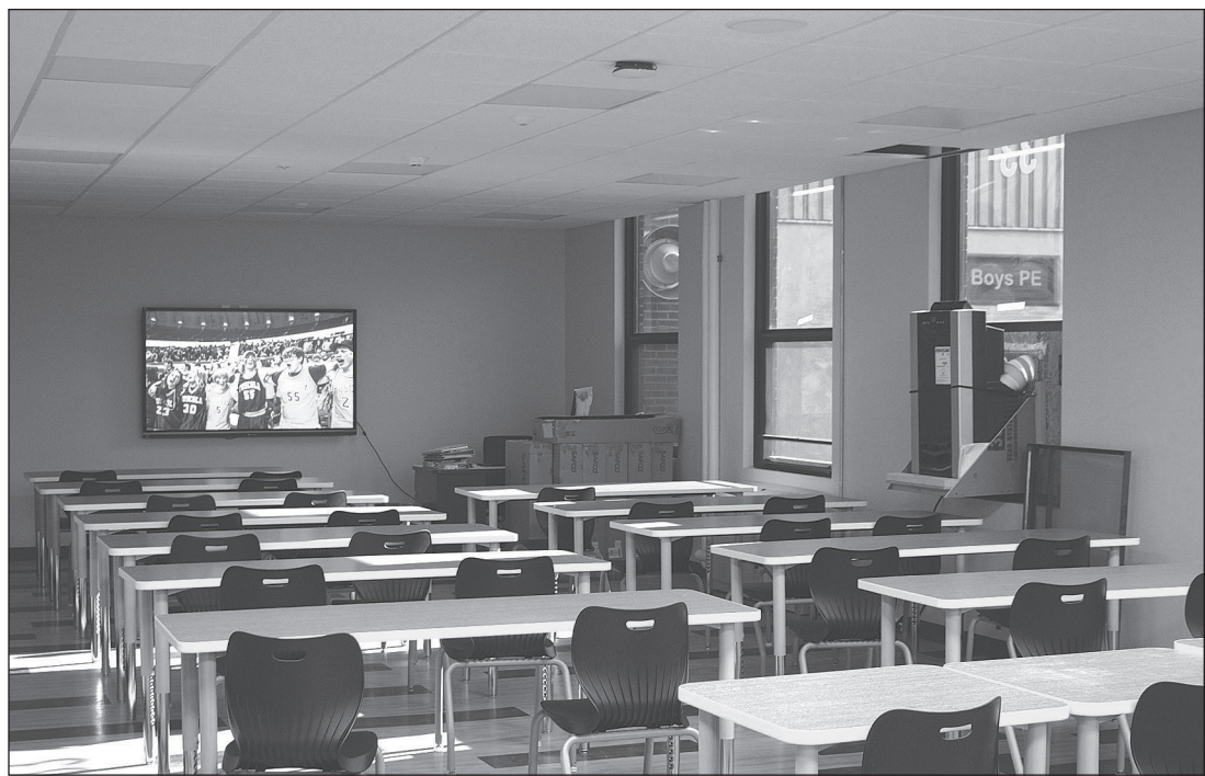
EVERY CLASSROOM is currently equipped with a mobile air conditioning unit until the original models arrive and are installed. Classrooms now come with new storage, providing educators with enough storage space for class. The art room, located on the west side of the school's northern wing has enough space for regular class as well as rolling high tables, which are not pictured.