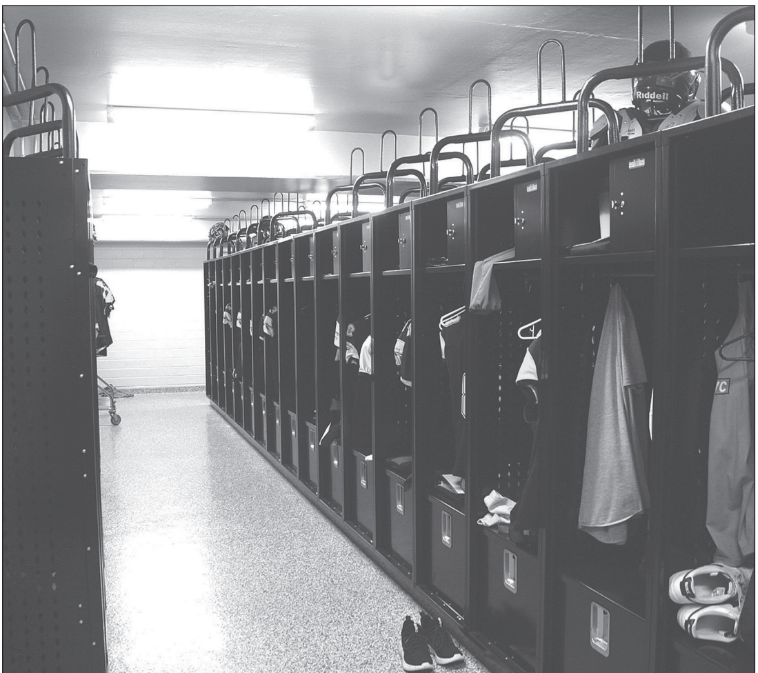
TUSCOLA ATHLETES have brand-new lockers in each locker room. Football players have 60 new lockers in which they can hang coats, store equipment and secure personal belongings. The epoxy floor has been redone with a speckled black, white, yellow and gray epoxy finish.