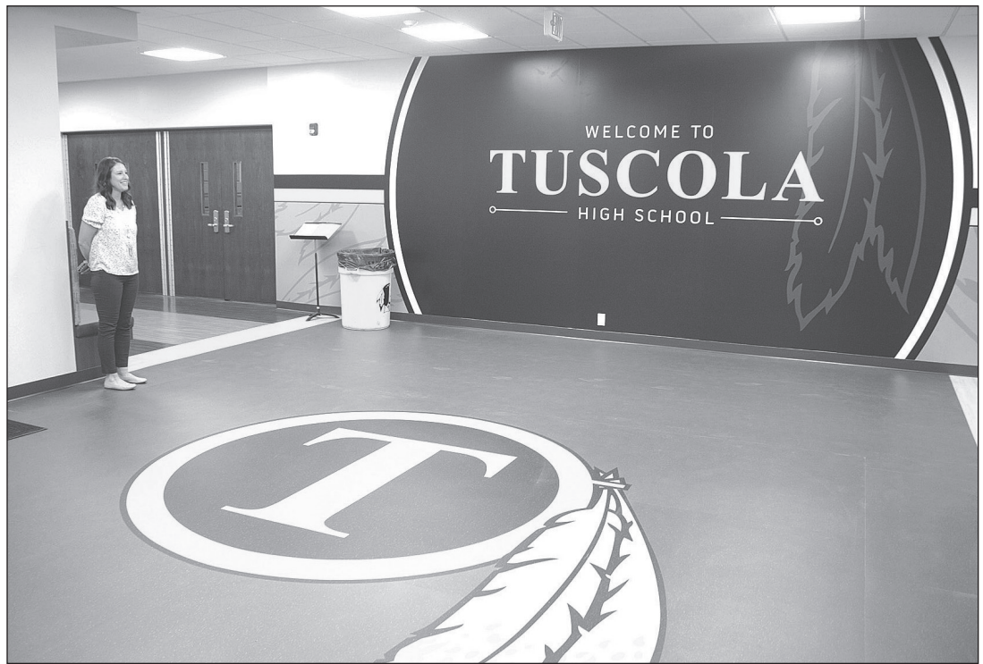
A 'WELCOME TO TUSCOLA HIGH SCHOOL' mural adorns the central lobby of the school and can be seen when walking through the school's main entryway. Two more murals are planned to line walls in the High School.