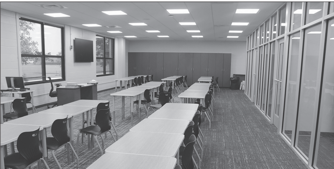
THE STUDYHALL, just past the library, now features new "focus rooms" which are private rooms with new glass white-boards and electronic boards to plug into. Students can work on projects or take tests in the rooms.