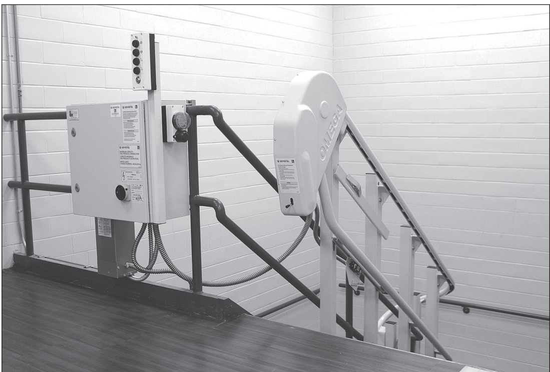
STUDENTS WITH INJURIES OR DISABILITIES will now be able to use a chairlift to access the high school's second floor. Entire classrooms had to be previously moved to accommodate students. New bathrooms now also have handwave sensors, to allow easier access.