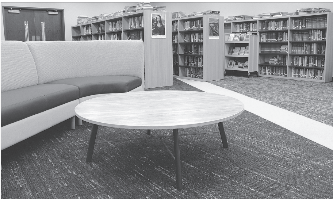
THE LIBRARY has received a complete overhaul with new shelving, flooring and furniture. The southern wall, previously glass, has been turned into a wall to separate the library from the study hall.