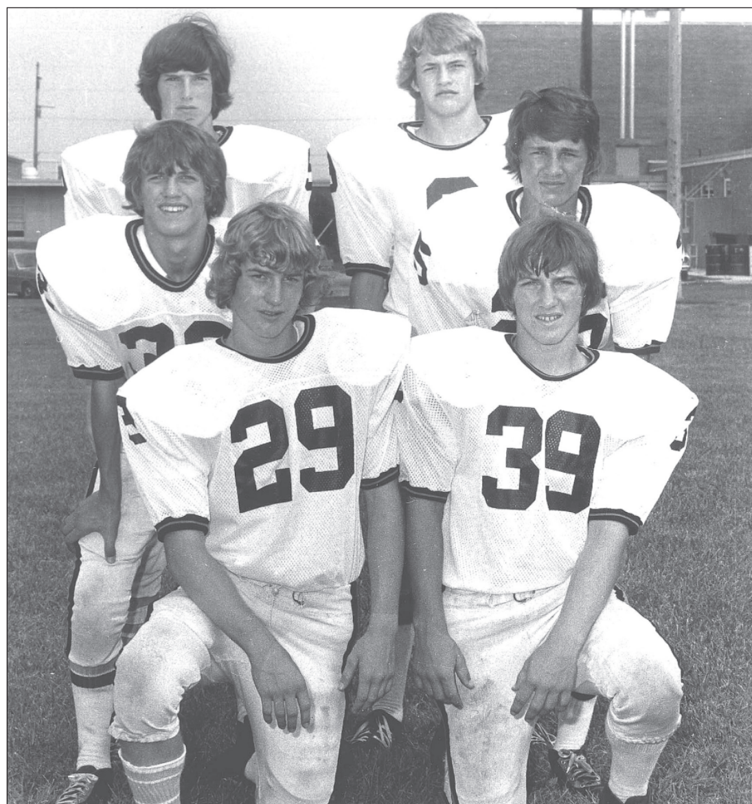
DO YOU RECOGNIZE this week's Back in the Day photo? If so, drop us a note at The Journal. Your efforts will be rewarded.