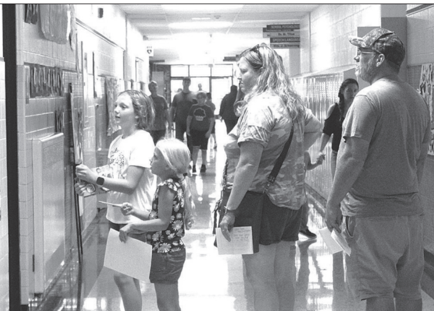
PARENTS AND COMMUNITY MEMBERS were able to see Villa Grove classrooms during the open house Aug. 31. Parents could meet with their kids' teachers, inspect the artwork of students and much more. The building was packed full with visitors. Villa Grove FFA also sold food during the event as well. A bookfair sold a variety of different books to those attending.