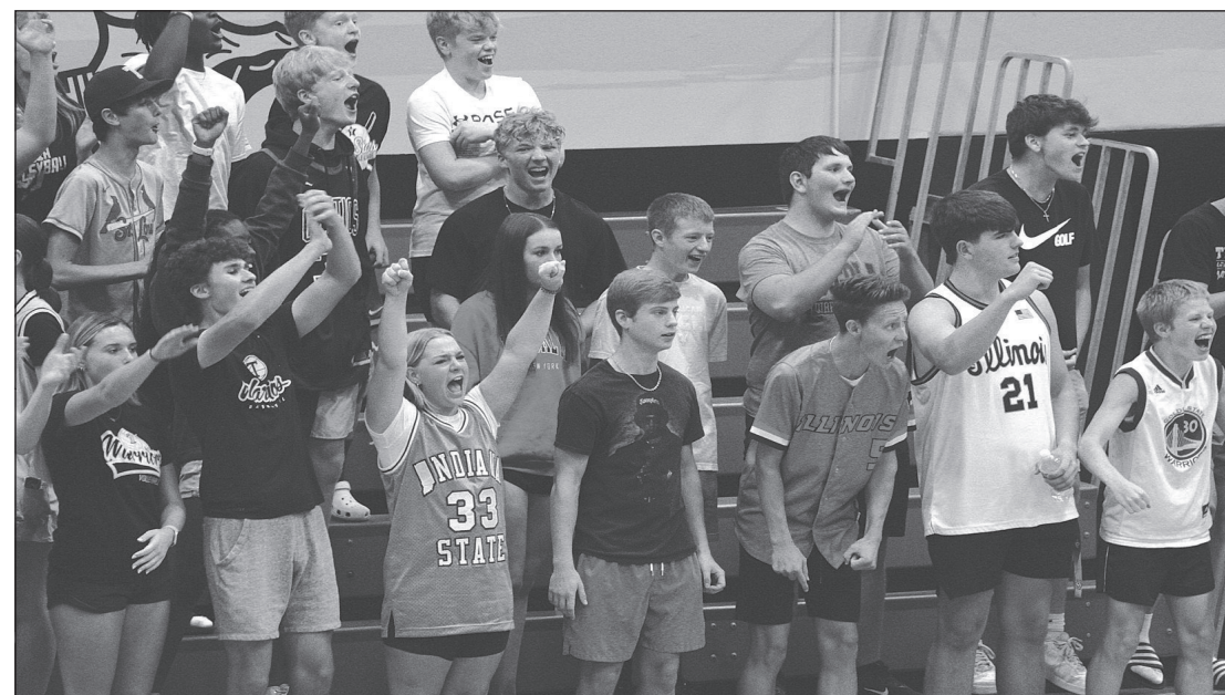
TUSCOLA STUDENTS cheer loudly during the Aug. 29 volleyball game against Villa Grove.