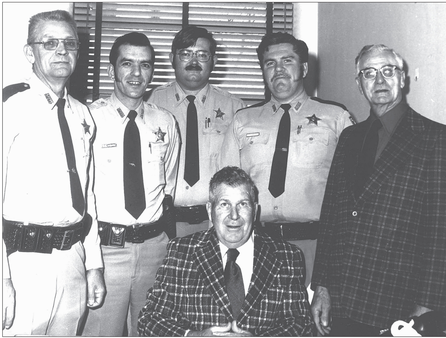
DO YOU RECOGNIZE this week's Back in the Day photo? If so, drop us a note at The Journal. Your efforts will be rewarded.