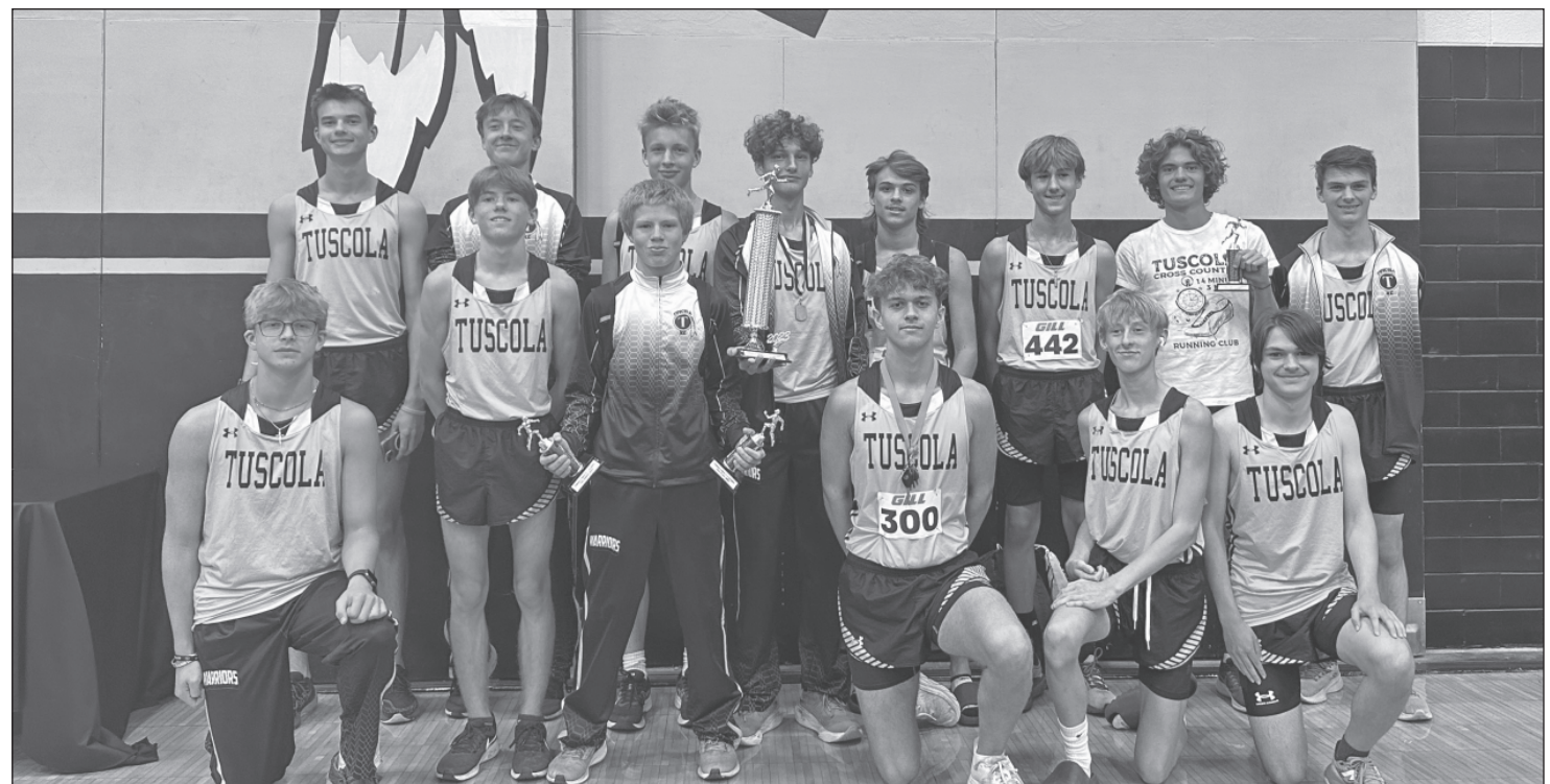
WARRIOR BOYS CROSS COUNTRY runners proudly display their hard-earned trophies at the Tuscola Classic meet on Sept. 16.