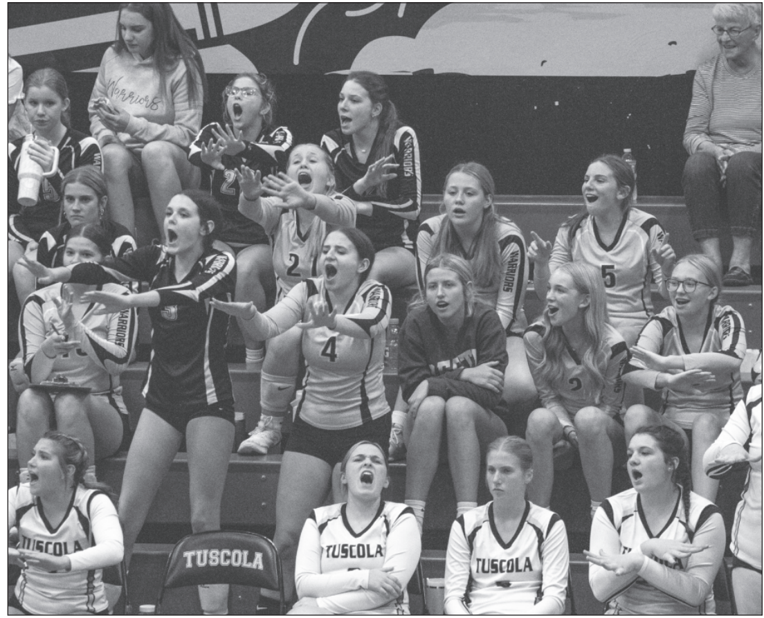
THE TUSCOLA VOLLEYBALL team members on the bench show their support for the varsity players playing against Argenta-Oreana. Tuscola lost 0-2.