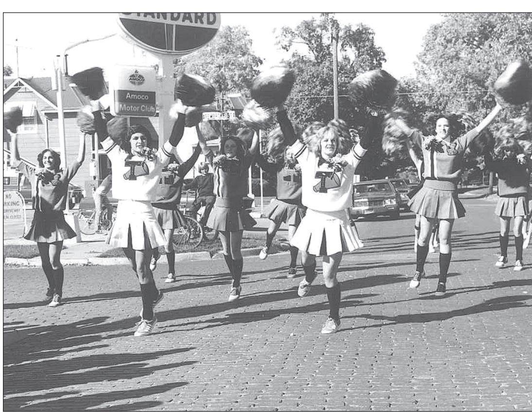
DO YOU RECOGNIZE this week's Back in the Day photo? If so, drop us a note at The Journal. Your efforts will be rewarded.