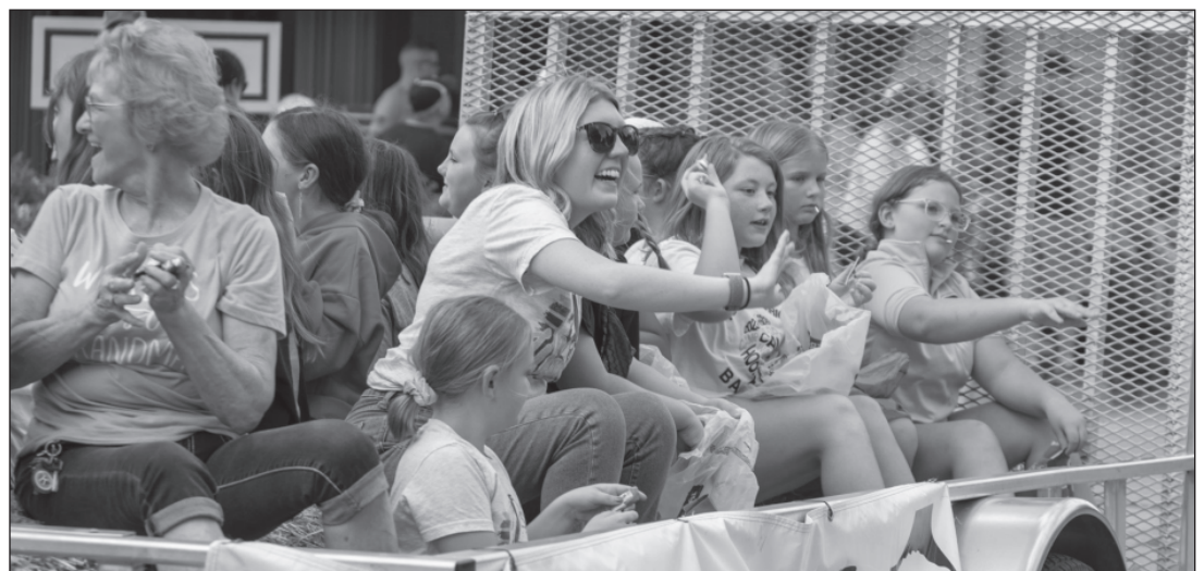
TUSCOLA KIWANIS AND K-KIDS wave to the crowd while throwing candy during the Sept. 22 Homecoming Parade.