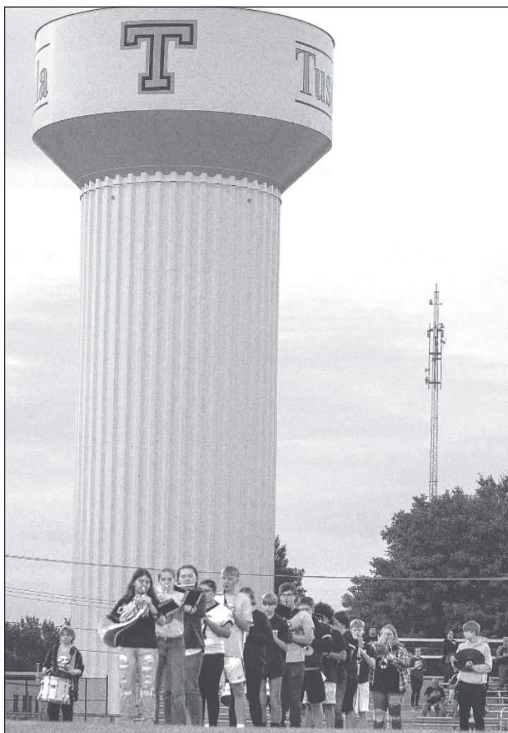
TUSCOLA HIGH SCHOOL BAND performs the "Star Spangled Banner" Sept. 22 before the start of the homecoming football game against the Central A&M Raiders.