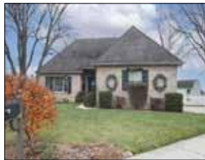
1 1/2 STORY BEAUTY located in the lovely CAMBRIDGE MEADOW neighborhood features 4 beds/3bath (2/1). Oversized and level cul-de-sac lot with open LR & DR & Kitchen! Main floor master, 2 add'l beds up and partial basement finish. Call today! $279,900 355 Kingsbury Court, Highland