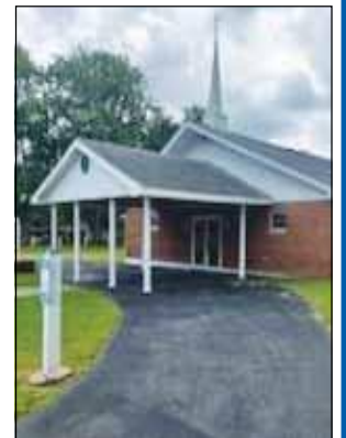
Covered entry way, 3000 sq ft church. Garden shed included. Selling " as is". $200,000 109 College Street, Alhambra