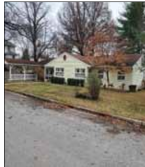
This 3 bedroom home is situation on a corner lot and is minutes from grade school and high schools. $169,900 870 Clinton Street, Carlyle