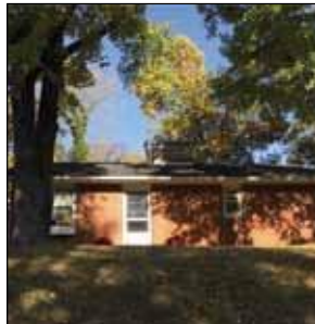
This all brick home has just been updated with new: 90+ HVAC, vinyl plank flooring, solid surface countertops, kitchen cabinets, vent hood, range, refrigerator, washer, dryer, garage door, interior paint, and lighting fixtures $164,900 2131 Hill Crest Drive, Highland