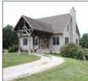
"Rare home plus business opportunity on 20 acres in large lake area. Amish built 3 bedroom, 3 bath home with 46 x 24 building, solar array, and beautiful 3900 sq ft building currently operated as popular restaurant and winery that can be purchased separately on 5 acres. Additional 14 acres available. Many possibilities come to mind when you visit this unique property. $950,000 1349 Red Ball Trail, Greenville