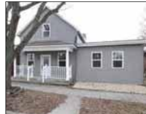
Updated 3 Bedroom, 2 Bath home located in the center of town .Master Bath/Laundry rm. Bedrooms 2 & 3 are on the main floor. $199,000 1208 Main Street, Highland