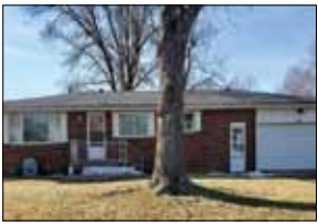
This 3 bedroom brick ranch home is situated on a corner lot and includes 2 additional parcels to the north, all 3 lots total .46 acres. $195,000 328 S Windmill Street, Marine