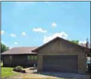
Home is on a dead end Street with a large yard, 2 car attached garage and 28 x 40 Cleary Outbuilding! Home has 3 bedrooms, 2 full baths with main floor laundry. Seller to do NO REPAIRS. Selling "AS IS" $149,000 247 Center Street, Pocahontas