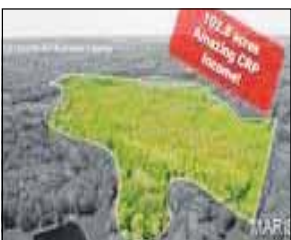
Great opportunity to own 102.8 acres of exceptional hunting ground in Bond County with CRP INCOME! Current CRP contract offers an annual income of $25,963 and consists of 4 parcels with property tax totaling $1150.66. Three CP22 (tree) contracts expiring in 2030, two CP42 (pollinator) contracts expiring 2026 & 2027. $650,000 1297 Oak Grove School Road, Donnellson