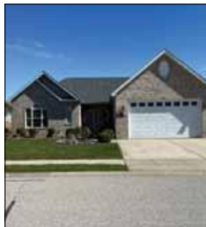
NO steps! Beautiful 3 bedroom ranch w/engineered wood floors, vaulted ceiling in living room, beautiful large kitchen w/quarts countertops, 2 car garage. $295,000 2716 Pine View Drive, Highland