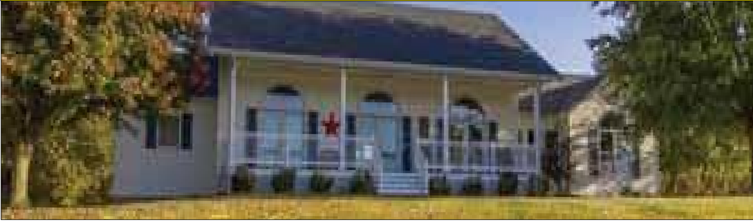
Looking for a ranch home with acreage? Here is an opportunity for you! Sitting on just over 11 beautiful acres with mature trees $449,000 1401 Niggli Road, Alhambra 10 acres to potentially build on or use as recreational ground/hunting in the Highland School district. $100,000 11359 Niggli Road, Alhambra