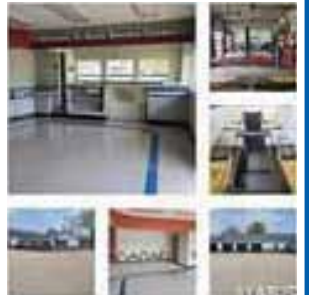
This former Automotive Repair Shop offers endless commercial possibilities and has - approximately 1000 sq. ft. of storage area. $358,000 391 Franklin Street, Carlyle