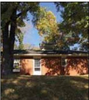
This all brick home has just been updated with new: 90+ HVAC, vinyl plank flooring, solid surface countertops, kitchen cabinets, vent hood, range, refrigerator, washer, dryer, garage door, interior paint, and lighting fixtures $164,900 2131 Hill Crest Drive, Highland