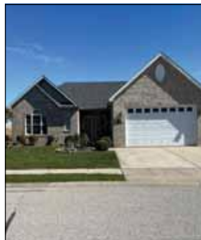
NO steps! Beautiful 3 bedroom ranch w/engineered wood floors, vaulted ceiling in living room, beautiful large kitchen w/quarts countertops, 2 car garage. $295,000 2716 Pine View Drive, Highland