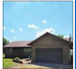
Home is on a dead end Street with a large yard, 2 car attached garage and 28 x 40 Cleary Outbuilding! Home has 3 bedrooms, 2 full baths with main floor laundry. Seller to do NO REPAIRS. Selling "AS IS" $149,000 247 Center Street, Pocahontas