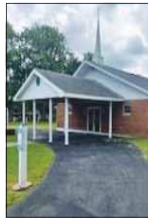
Covered entry way, 3000 sq ft church. Garden shed included. Selling " as is". $200,000 109 College Street, Alhambra