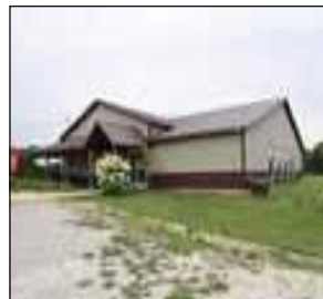
Business opportunity on 5 rural acres in large lake area! Resume or create your own business in beautiful 3900 sq ft building currently operated as popular restaurant and winery. Adjacent & available are a rare Amish built home on 15 acres and a vacant 14 acre parcel. Many possibilities! $650,000 1349 Red Ball Trail , Greenville (restaurant)