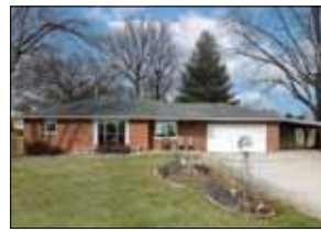
Location, Location, Location! FANTASTIC FULL BRICK RANCH HOME WITH A FANTASTIC VIEW & CONVENIENTLY LOCATED TO ALL AMENITIES! 3 BED/1 BATH SOLID BEAUTY WITH tons of ATTRACTIVE features. 2 car garage, 1 car carport, full basement, newer windows and SO MUCH More! Call today $189,900 12437 State Rt 143, Highland