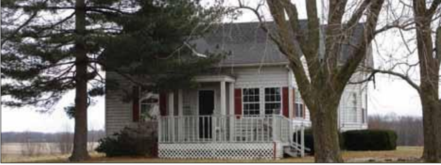
Attractively remote farm house, newer garage on 2 acres with spectacular view. $126,000 456 East Ridge Road, Vandalia

OPEN HOUSE ON THIS NEW LISTING Saturday, Feb 4, 2023 | 11:00 .am. – 1:00 p.m. Hosted by: Bill Richker & Kris Dempsey