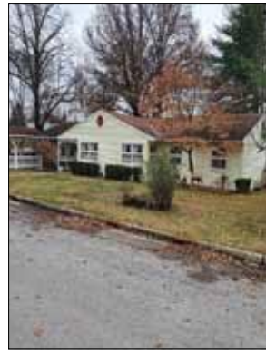
This 3 bedroom home is situation on a corner lot and is minutes from grade school and high schools. $169,900 870 Clinton Street, Carlyle