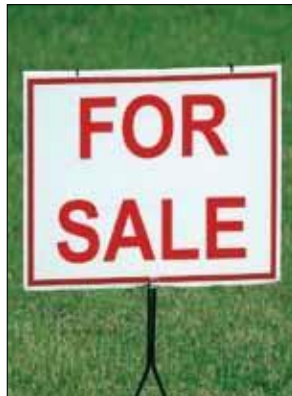
10 acres to potentially build on or use as recreational ground/hunting in the Highland School district. $100,000 11359 Niggli Road, Alhambra