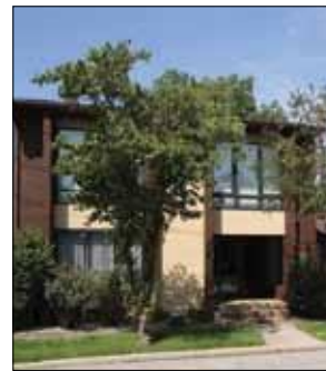
BEAUTIFUL QUALITY OFFICE BUILDING! Ample parking with its own paved lot in the rear with about 18 spaces and extra street parking at front door. Situated off Broadway in the heart of town, $450,000 1210 Washington Street, Highland