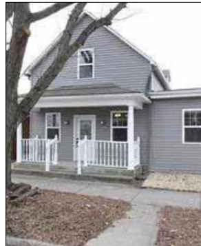
Updated 3 Bedroom, 2 Bath home located in the center of town .Master Bath/Laundry rm. Bedrooms 2 & 3 are on the main floor. $199,000 1208 Main Street, Highland