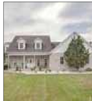
Spectacular 2 story home on 1.33 acres & lake. Quality construction evident in the 5200+ fin sq ft. Geothermal, oversized garage, mature landscaping, & much more. $442,000 4944 Leeward Ct, Aviston