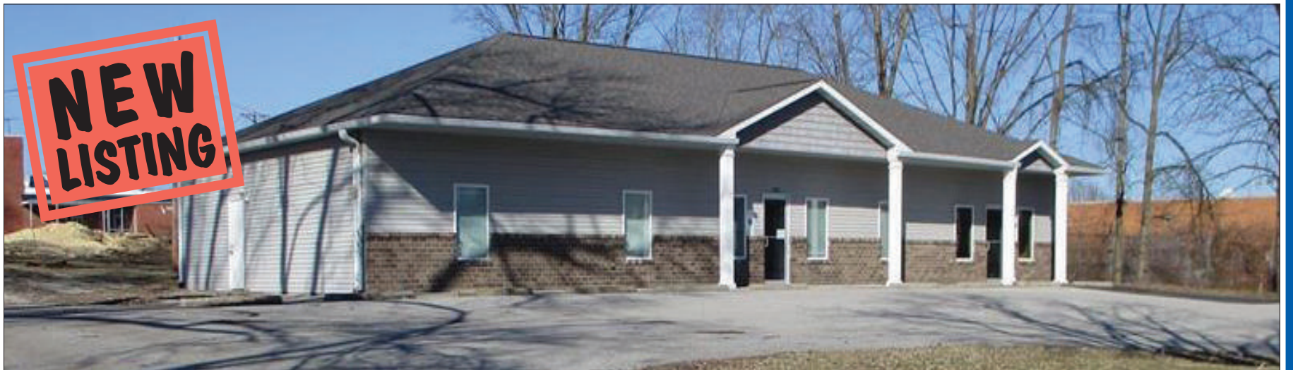
Well known Professional Retail building on Walnut High traffic area. $475,000 206 Walnut Street, Highland

Our new address is 806 Broadway, Highland (Next to Beauty on Broadway)