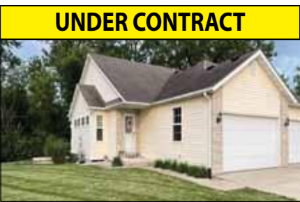
UNDER CONTRACT 335 A Jarvis Ct, Troy