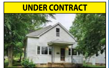
UNDER CONTRACT 408 Laurel Street, Highland $89,000