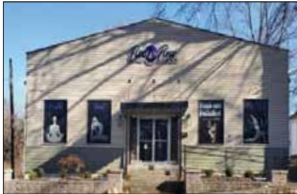
Here's your chance to own a beautiful turnkey 5000 sq. ft. commercial business. Currently offers a Nail Salon and Massage services (two separate tenants). . 690 7th Street, Carlyle $249,900