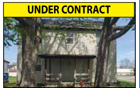
UNDER CONTRACT 3 bedroom, 1 bath, home located on a spacious corner lot in the heart of Aviston! There's a 17 x 17 storage building as well as an oversized two car detached garage with alley access and concrete driveway! 99 East 3rd Street, Aviston