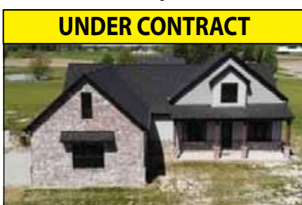
UNDER CONTRACT 2799 Water Lily Lane, Highland $450,000