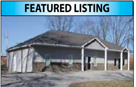
FEATURED LISTING Well known Professional Retail building on Walnut High traffic area. 206 Walnut Street, Highland $460,000