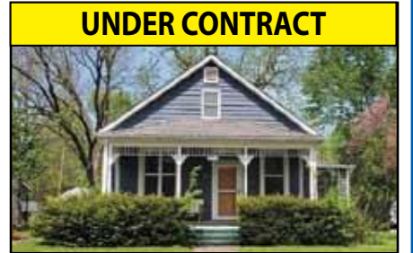
UNDER CONTRACT 3 bedroom, 1 bath, home situated on a corner lot . A detached two car garage offers protection from the elements and the full basement provides for additional storage! 1711 Fairfax Street, Carlyle $87,000