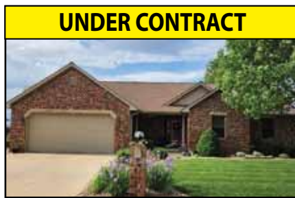
UNDER CONTRACT 20 Wren Drive, Highland $299,000