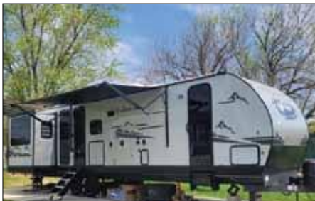
UNIQUE opportunity to purchase a lot near Carlyle Lake with a NEW 2022 Forest River Cherokee, Black Wolf Edition travel trailer. 21533 Fox Lane, Carlyle $99,900