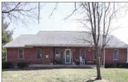
ENJOY COUNTRY LIFE IN BEAUTIFUL CUSTOM-BUILT HOME! 3 Beds, 3 baths, open floor plan & easy traffic flow of the home with garage leading into the laundry with sink & 1/2 bath, then into very spacious kitchen and breakfast area. 3918 Buffalo Road, Highland $650,000