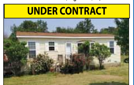
UNDER CONTRACT 14596 Hahn Road, Carlyle