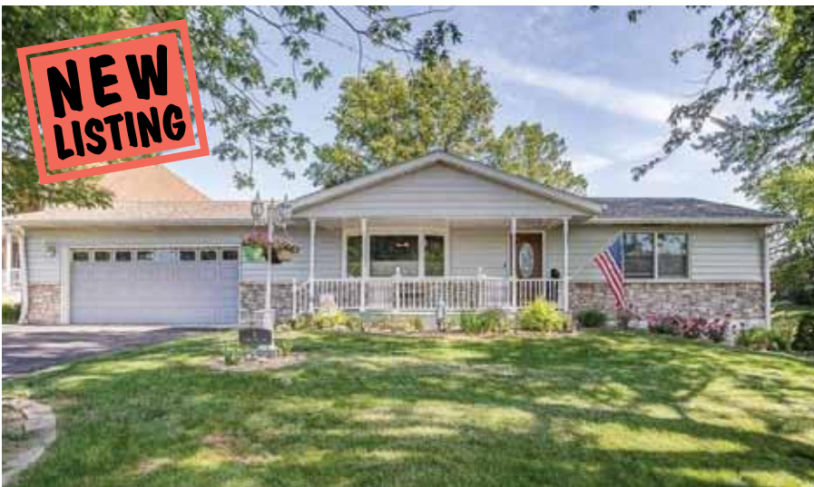
NEW LISTING Ranch home on Holiday Lake in Holiday Shores! 3 BD, 2 BA, Lake lot, dock, lift for boat 10 Shore Drive, Edwardsville $299,900