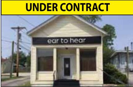
UNDER CONTRACT A GREAT OPPORTUNITY! Quaint and Reasonable office or storefront just off the Highland square in the heart of town! There are 2 carpeted offices, kitchen, and half bath. If you're looking for a small store or office space of your own, don't pass this by. 1110 Washington, Highland $75,000