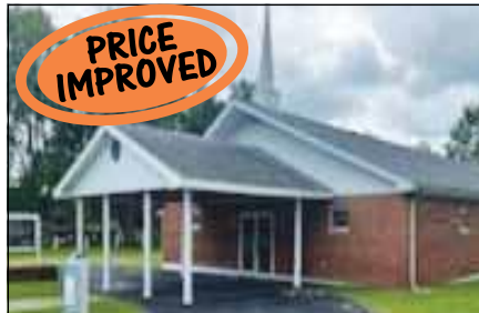
PRICE IMPROVED Covered entry way, 3000 sq ft church. Garden shed included. Selling " as is". 109 College Street, Alhambra $175,000