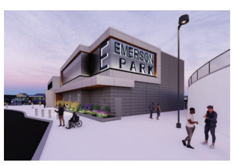
Emerson Park MetroLink

Safe transportation propels a growing regional economy. In partnership with the St. Clair County Transit District, FGMA has designed a new Public Safety Building at the Emerson Park MetroLink station. Funded in part by a $9.75 million Rebuild Illinois grant, this 16,000 sf, facility (in construction for a projected 2024 opening) will house MetroLink Security, the Metro Transit Operations Control Center and