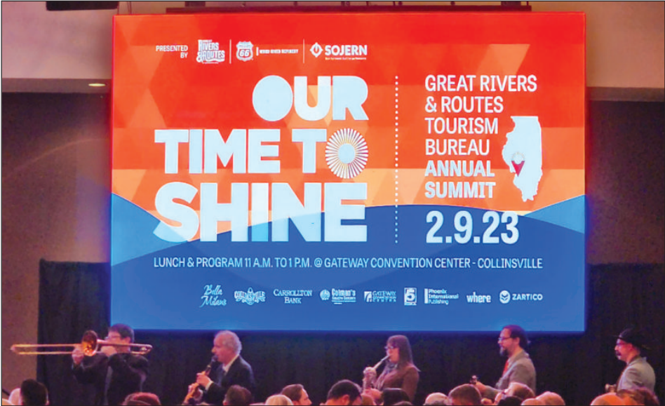
The New Orleans-style jazz ensemble brings its parade of sound to the front of the crowd and a colorful screen display as the 2023 Tourism Summit hosted by the Great Rivers & Routes Tourism Bureau kicked off on Feb. 9 at Collinsville’s Gateway Convention Center. A fountain of pyrotechnics from stage corners left and right would soon follow.