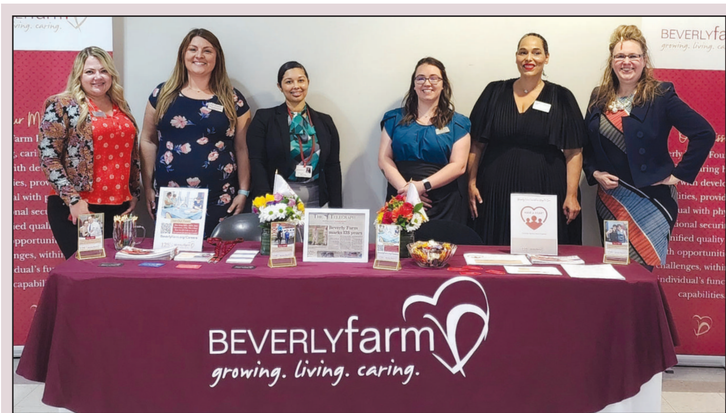
The RiverBend Growth Association hosted its annual Chamber Choice Awards luncheon on May 24 at Lewis and Clark Community College in Godfrey. Beverly Farm Foundation, as the event’s Title Sponsor and Perseverance Award honoree, had staff on hand to greet attendees and answer any questions about Beverly Farm’s services and employment opportunities.

Sponsored by Cope Plastics, Inc., there were also two Legacy Awards presented. These awards are given to outstanding individuals who have recently retired after years of service to the