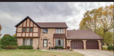
1207 S. MACOUPIN ST. - GILLESPIE [ $275,000 ] 3 BR, 3 BA INGROUND POOL