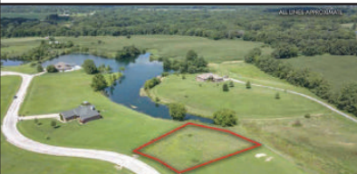
TBD WOLF RIDGE TR. - BUNKER HILL [ $37,000 ] RES. LOT VACANT LAND