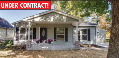
236 VIRGINIA ST. - BRIGHTON [ $156,000 ] 3 BR, 1 BA OVERSIZED GARAGE