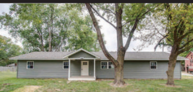
484 ELDER ST. - PALMYRA [ $154,900 ] 3 BR, 2 BA MUD ROOM