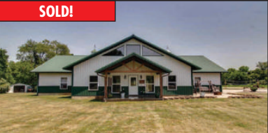
3199 TERPENING RD. - ALTON 3 BR, 4 BA 5 +/- ACRES, COVERED PATIO