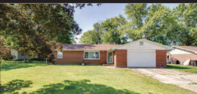
715 CARLINVILLE RD. - SHIPMAN [ $119,000 ] 3 BR, 2 BA EAT-IN KITCHEN