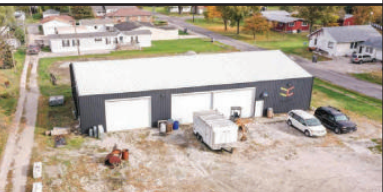
200 W. MOUNTS - CARLINVILLE [ $250,000 ] COMI. LAND GARAGE/OFFICE