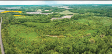
TBD SCHROEDER LN. - PLAINVIEW [ $360,500 ] 102 +/- ACRES HUNTING RIGHTS, CREEK