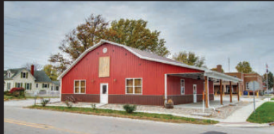
201 W. PINE ST. - GILLESPIE [ $360,000 ] COMI. LAND HIGH TRAFFIC, MIXED USE