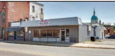
127 S. BROAD ST. - CARLINVILLE [ $179,900 ] COMI. LAND RESTAURANT, PARKING LOT