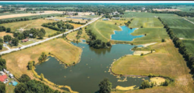
TBD W. CITY LIMITS RD. - BRIGHTON [ $936,000 ] 78 +/- ACRES POND/LAKE, BARN(S)