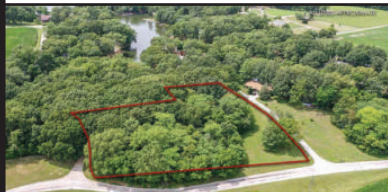
TBD RUNNING DEER LN. - CARLINVILLE [ $25,000 ] RES. LOT POND/LAKE, SOME WOODED