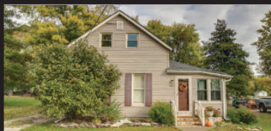
108 OAK ST. - BRIGHTON [ $110,000 ] 3 BR, 1 BA PATIO

BUY - SELL - AUCTION WWW.TARRANTANDHARMAN.COM