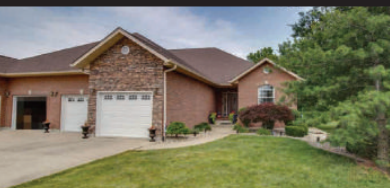
398 CANADIAN DR. - STAUNTON [ $264,900 ] 2 BR, 2 BA SUN ROOM, COVERED PATIO