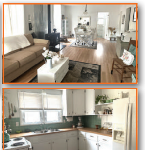
- 3 bedroom on town's edge with large living room with fireplace, enclosed porch, main floor laundry, basement, and more. $179,500