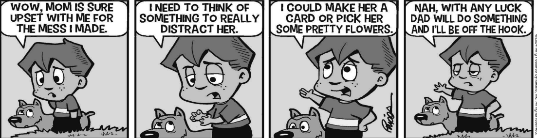
Out on a Limb