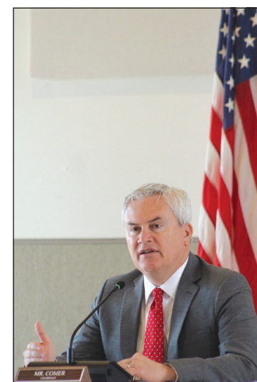
Congressman James Comer spoke at a hearing in Jamestown last week.

Discover Our Digital Copy At russellcountynewspapers.com