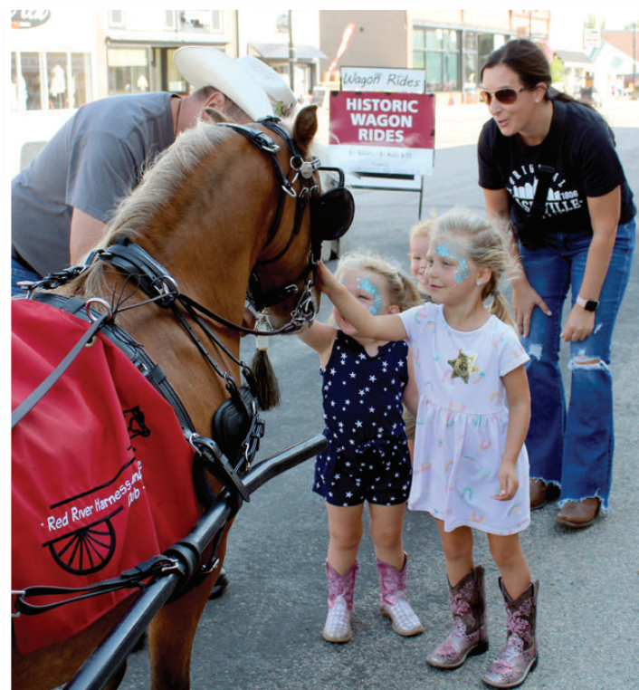
People enjoy petting the horses almost as much as the wagon ride!

HOME - AUTO - FARM - MULTI-PERIL - HAIL - BUSINESS