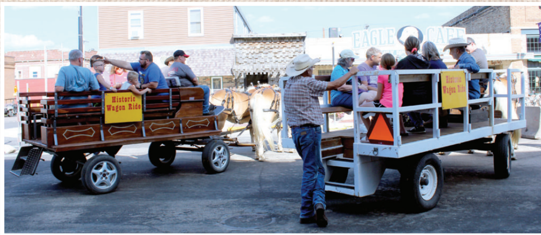
Horse drawn wagon rides are provided both Friday and Saturday of Potato Days by the Red River Harness & Saddle Club.

Red River Harness and Saddle Club provides wagon rides to the people attending Potato Days, a club tradition dating back more than a decade.