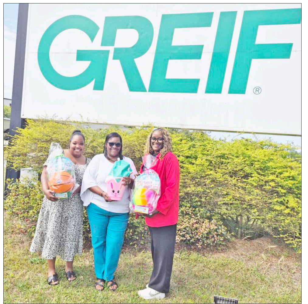
Pictured above and below are Greif employees preparing and posing with the Easter baskets they donated.