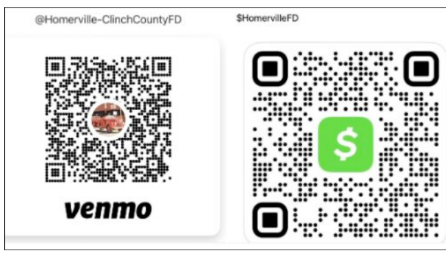
Above are cash apps (Venmo and cash app) where donations came be made to support local firefighters. At right is a map of where the Pineland Road Fire was located as of Monday afternoon. Below that are photos of Georgia Forestry Commission firefighters and equipment arriving at the fire location last week, and directly below is a place spraying the area of the fire last week.

Emergency shelters were opened for those affected by wildfires in South Georgia. Venture of Faith Camp, located at 1309 GA Highway 135 South in Lake Park was opened as a shelter