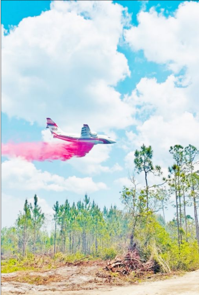
for those affected by the Pineland Road Fire.

Another large fire, in Brantley County, has destroyed 122 homes and is threatening nearly 1,000 more, as of Sunday evening.