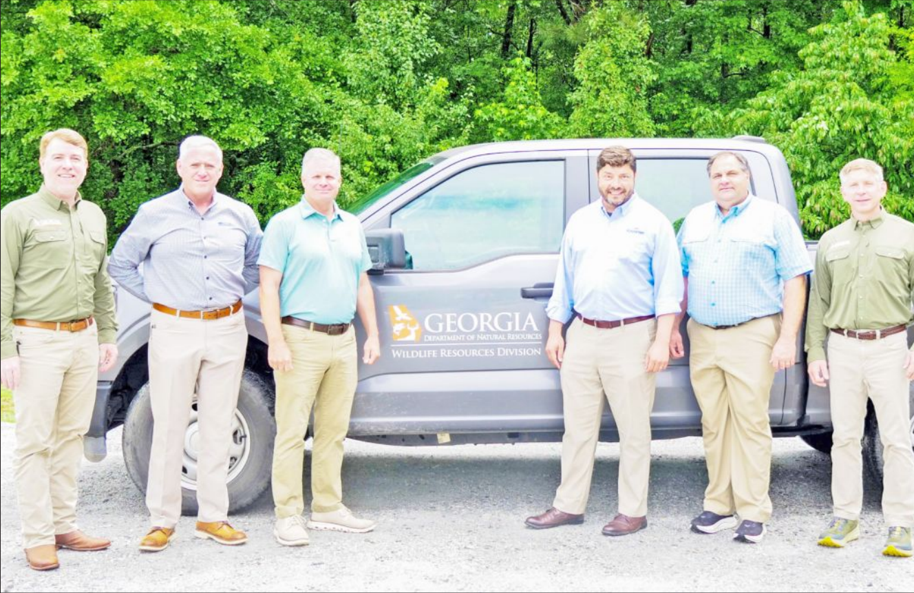
Above, representatives from Rayonier and Georgia DNR pose after announcing the donation.