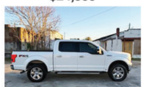
2020 Ford F-150 Lariat 4WD, Crewcab, v6 Ecoboost $28,900