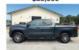
2019 Chevy Silverado 1500 LT Crewcab, 4x4 $23,900