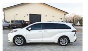
2021 Toyota Sienna Platinum Hybrid, Sunroof $24,900