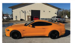
2018 Ford Mustang GT 6 speed manual, 59K miles $26,900