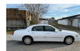
2011 Lincoln Town Car Signature - V8 $8,900