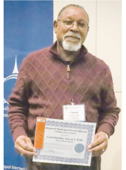
The MEO Institute and Advanced MEO Institute are two of the many educational and training opportunities that the Municipal Association offers for the elected officials and staff serving cities and towns. Learn more at www.masc.sc (keyword: education and training).

the Municipal Association's staff associate for training and learning solutions. Graduating officials have participated in at least four of the six courses offered to graduate from the Advanced MEO Institute. Topics include public safety, budgeting, utilities, advocacy, economic development and governance. The Advanced MEO Institute draws its faculty from South Carolina and across the country including recognized local government leaders, state officials, as well as college and university faculty. Established in 1986, the MEO Institute is a program of the Municipal Association of South Carolina. It gives municipal officials a strong foundation in the operation of municipal government.