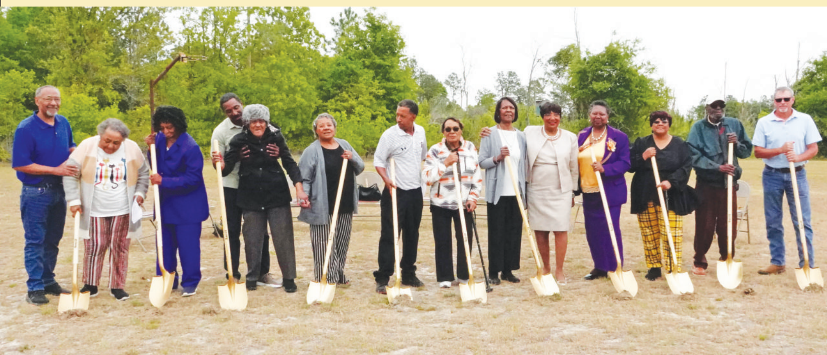
Sandy Grove United Methodist Church held a groundbreaking ceremony for their new fellowship building on Sunday, April 19 at 5810 Mt Pisgah Rd, Jefferson, SC. After some past fires, the church is ready to celebrate this new beginning chapter for the church community.