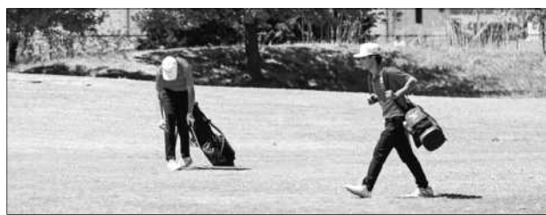
Mustang High School golfers walk the course at the Earlywine Golf Course.

Last week, the Mustang girls placed 10th at the Del City Invite after scoring a 342. They were 52 strokes behind first-place Norman North.