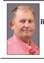
State Representative Ryan Bivens

The first session of the Kentucky General Assembly took place in 1792 in a two-story log structure in downtown Lexington. Lawmakers met for 23 working days and passed several pieces of legislation that laid the foundation for early statehood. Among those bills was a revenue measure aimed at providing the young Commonwealth the resources necessary to serve its people. The measure levied taxes on land, livestock and other holdings; required the licensing of taverns and retail stores; and implemented a tax on billiard tables and stamps for legal papers.