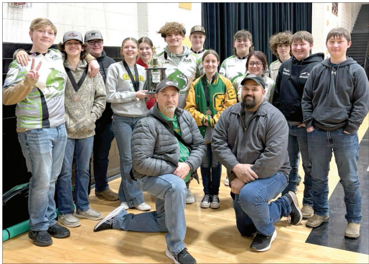
The Green County High School Archery team placed second in the Boyle County New Year's Bullseye Tournament Saturday, January 17, at Boyle County High School.

In middle school action, Woodford County Middle School finished first with 3,218 points. Green County