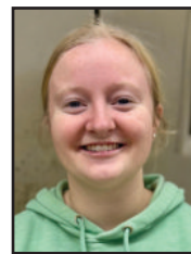
Carlee Retail & Greenhouse Support