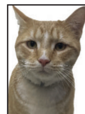
Ghost Pest Control/ Customer Relations 3 Years