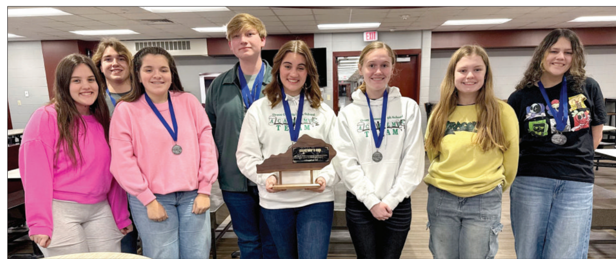
Several Green County High School Academic Team members are pictured with the trophy they received for winning the 16th District Governor's Cup title.