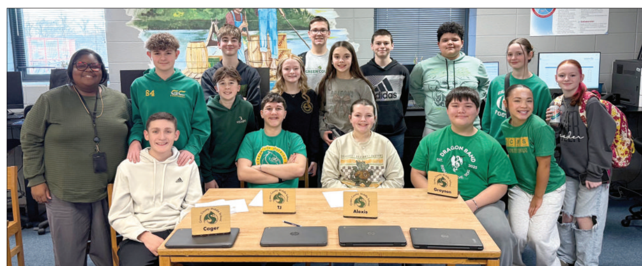
The Green County Middle School Academic Team recently won the 19th District Governor's Cup title.