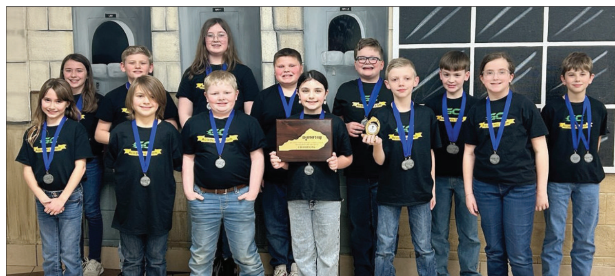
The Green County Intermediate School Academic Team recently won the 34th District Governor's Cup title.