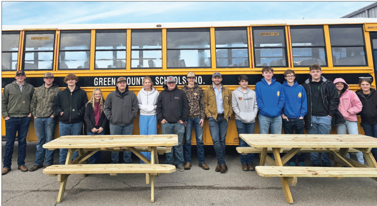
Ag Construction class with the picnic tables they delivered to the Kentucky Department of Agriculture.