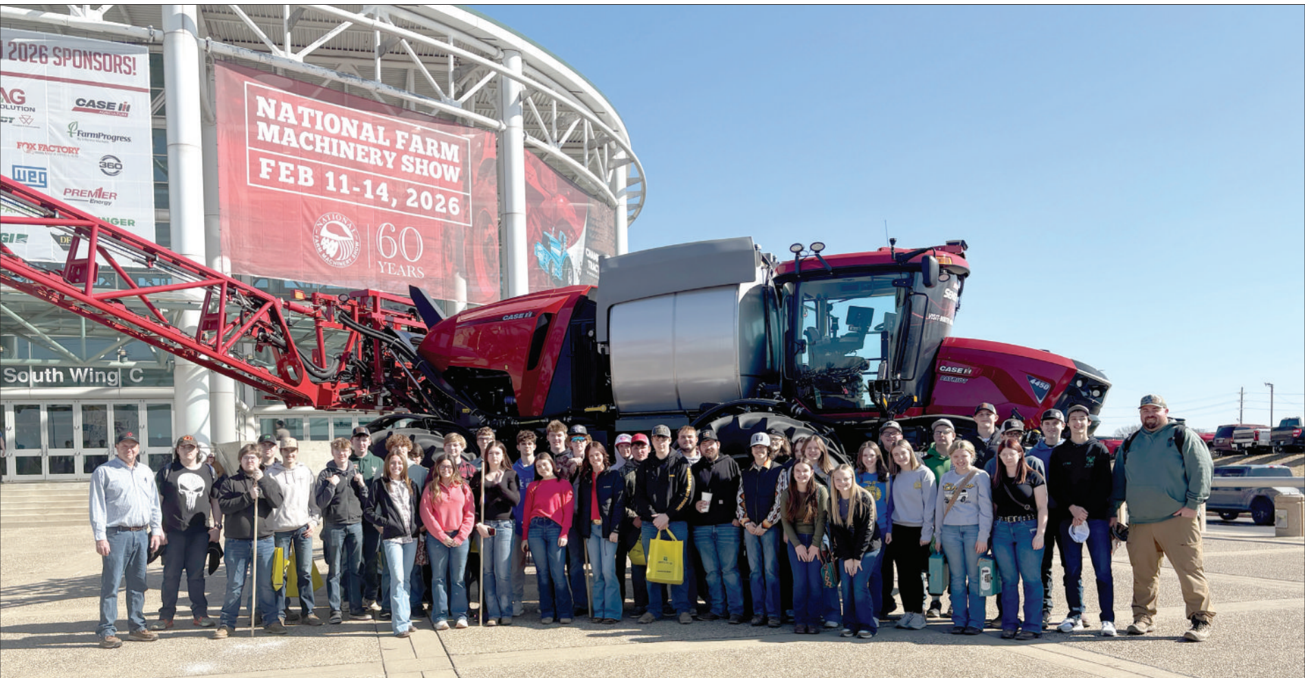
On February 13, 39 Green County FFA members, two advisors and numerous guests attended the National Farm Machinery Show and Championship Truck and Tractor Pull in Louisville.