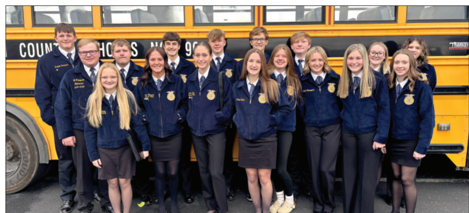
FFA members attended regional competitions in Russell County.