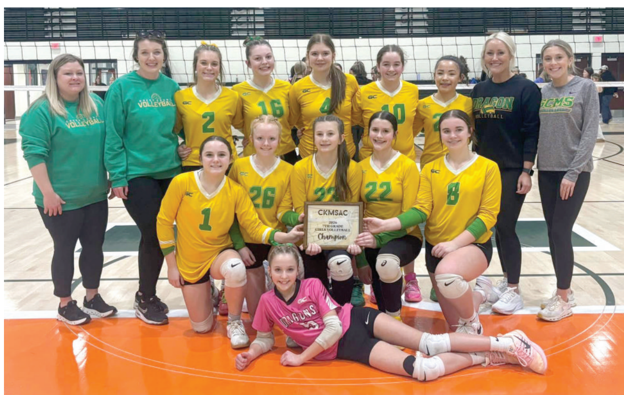
The GCMS 7th Lady Dragons soared to victory this season, finishing 16-1 and earning the title of 2026 CKMSAC Conference Champions.