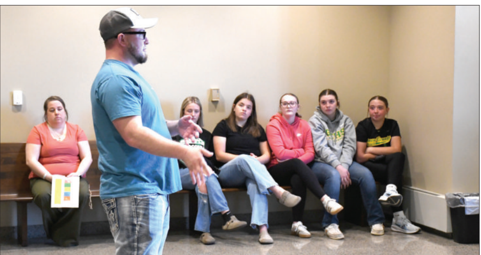
Volunteers from The Healing Place shared the stories of their lives with the freshmen from Green County High School during the Truth and Consequences program at the Green County Judicial Center last week.