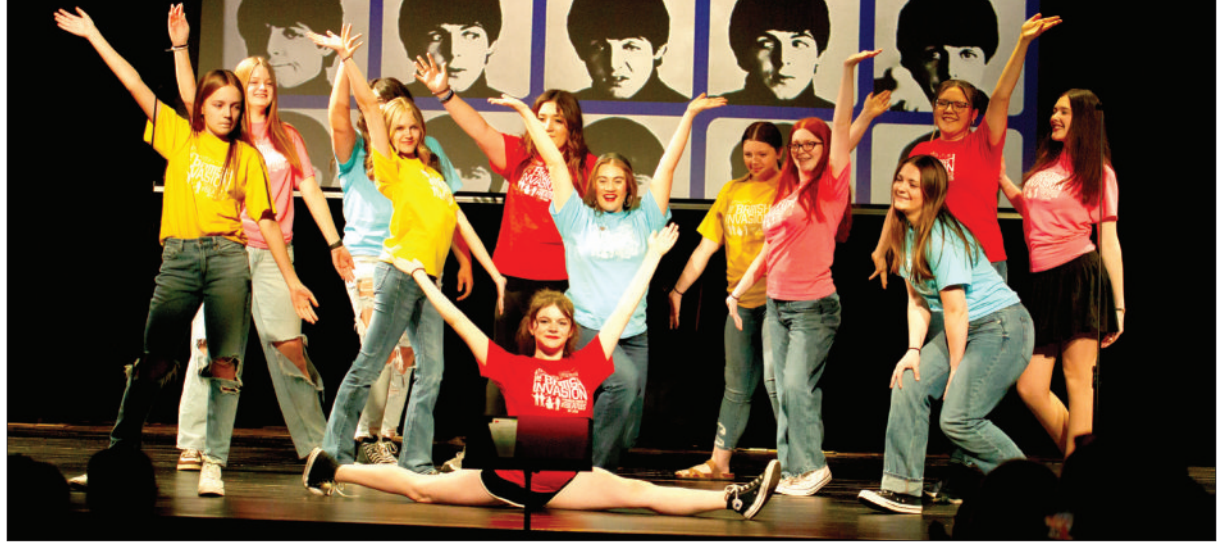
The Green County High School Show Choir took the stage with The British Invasion: A Musical Tribute to The Beatles, celebrating the timeless music of the iconic band. The choir performed beloved classics including "Swinging with the Beatles," "Yesterday," "Here Comes the Sun," and more.