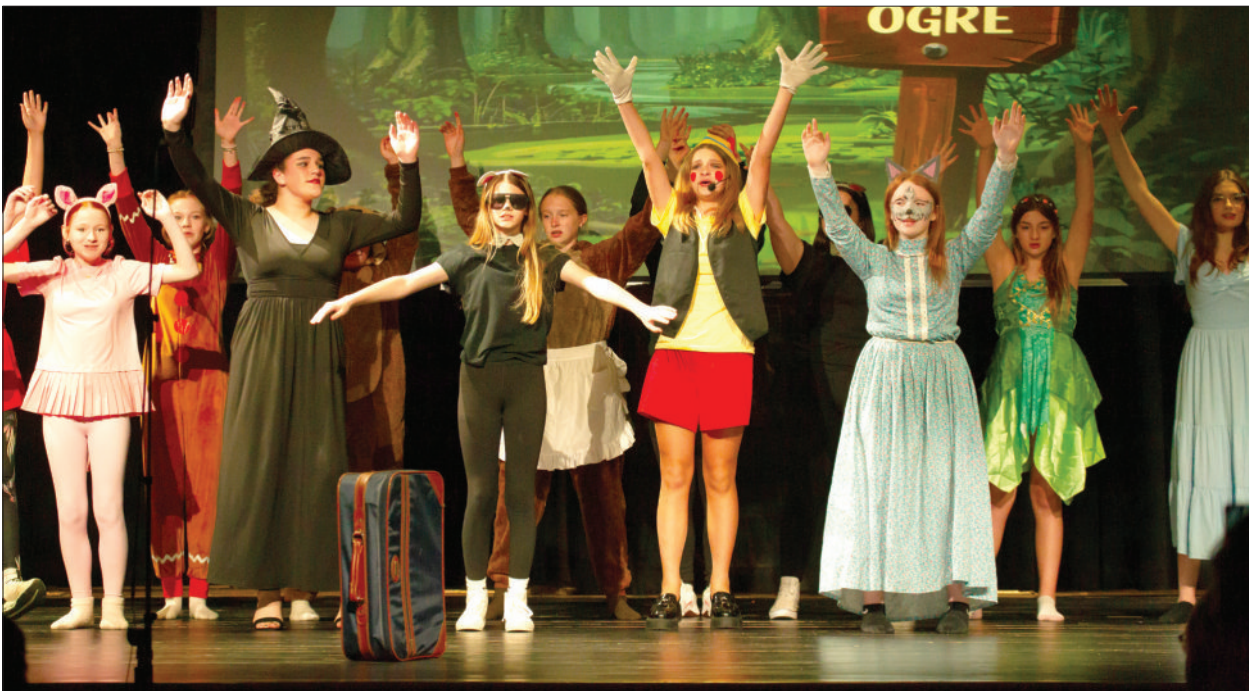
Monday night's GCMS Choir performance of Shrek the Musical: Kids brought a colorful cast of fairytale characters to life on stage.