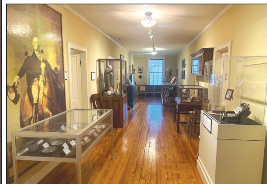
"The museum is a 501(c)3 educationally chartered history museum and all donations are tax deductible!"