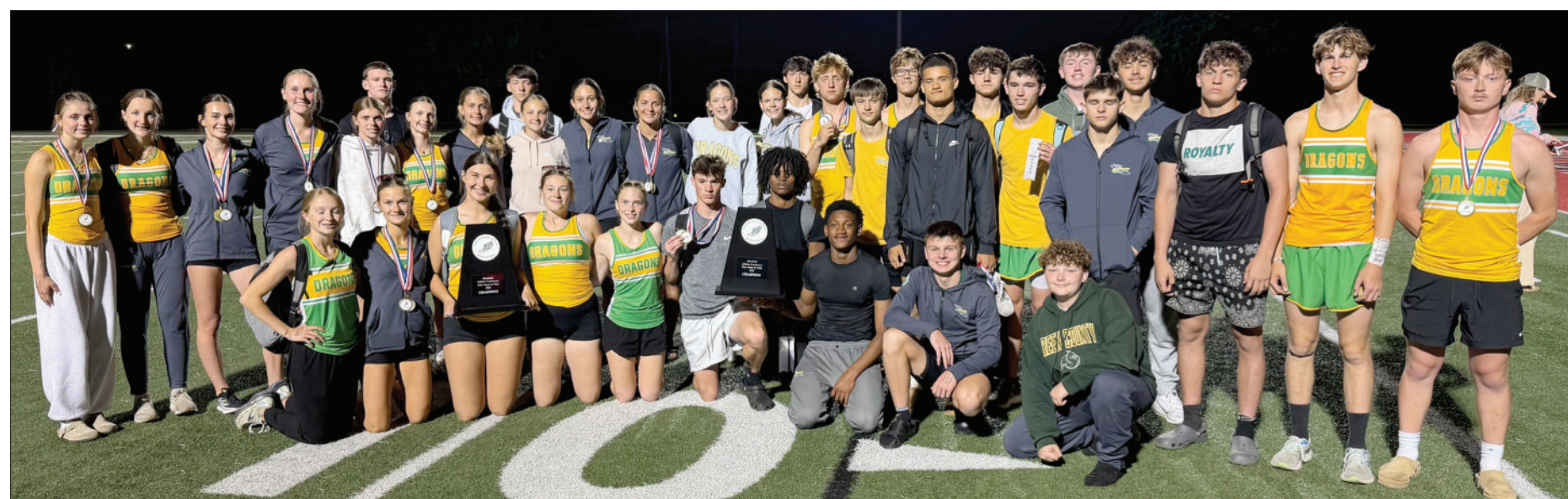
The Dragons and Lady Dragons won the Heartland Conference. This is the 26th conference title for the Dragons and the Lady Dragons' 23rd since the Heartland Athletic Conference began during the 1988-1989 school year.