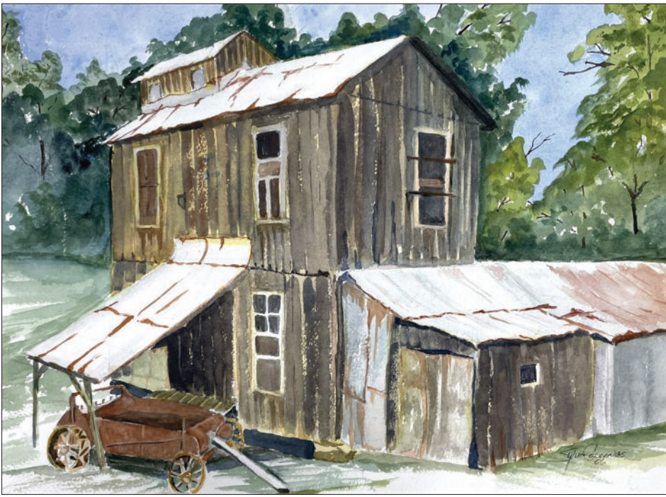
This painting by Sylvia Collings, completed in 2006, depicts the old mill at Ote.