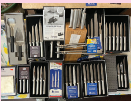
RADA Cutlery and Knife Sharpeners